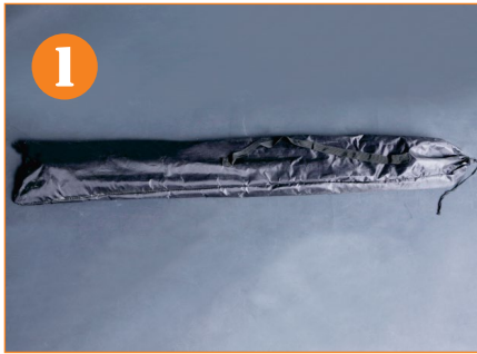
1. Carry bag with stand.