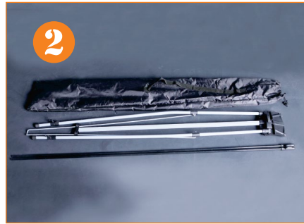
2. Take out the stand from the bag.