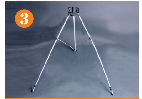
3. Open the base stand.