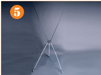
5. Completed BasiX frame.