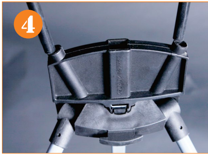
4. Insert the two top poles into the stand.